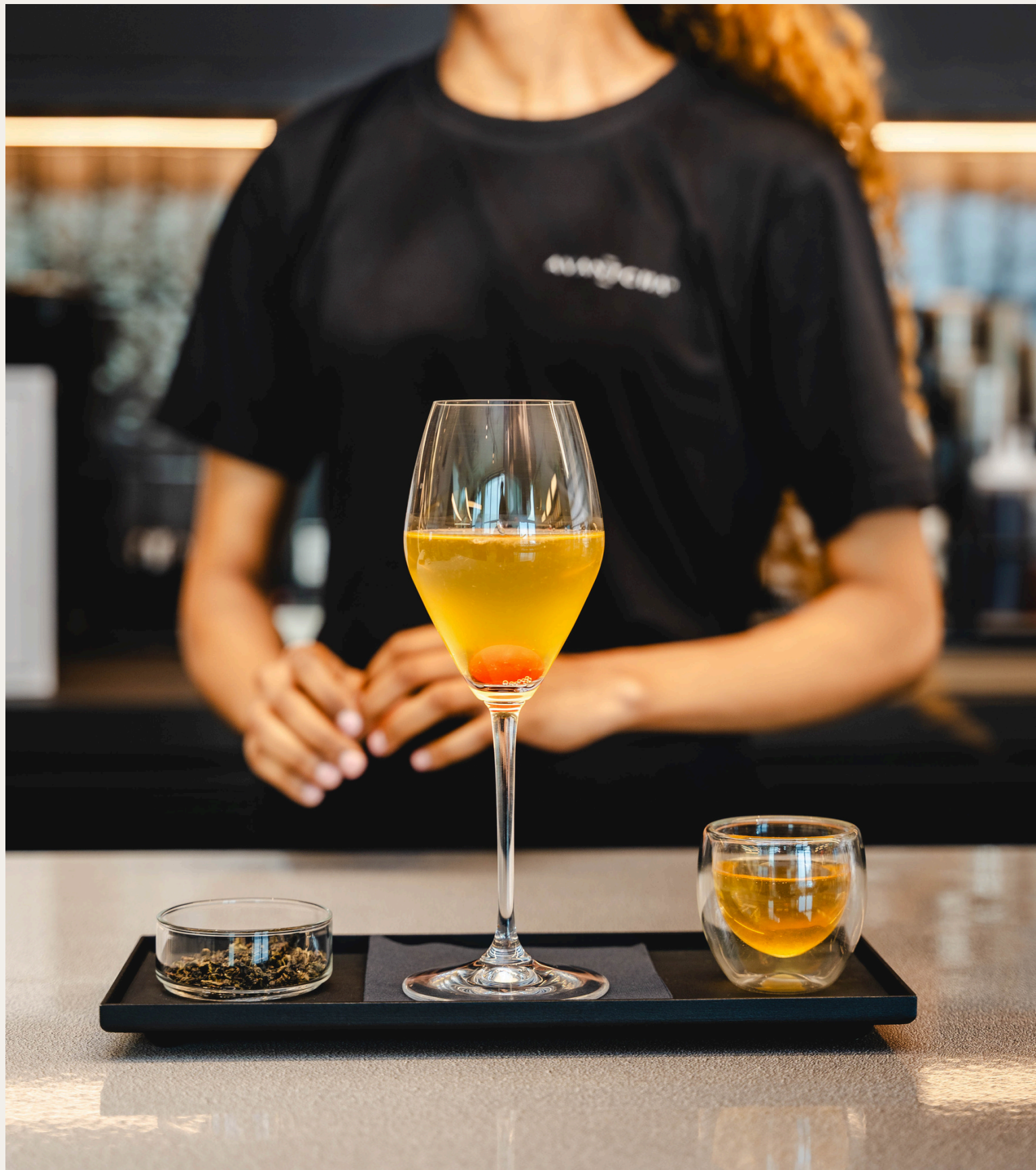
Scalify X Avantcha