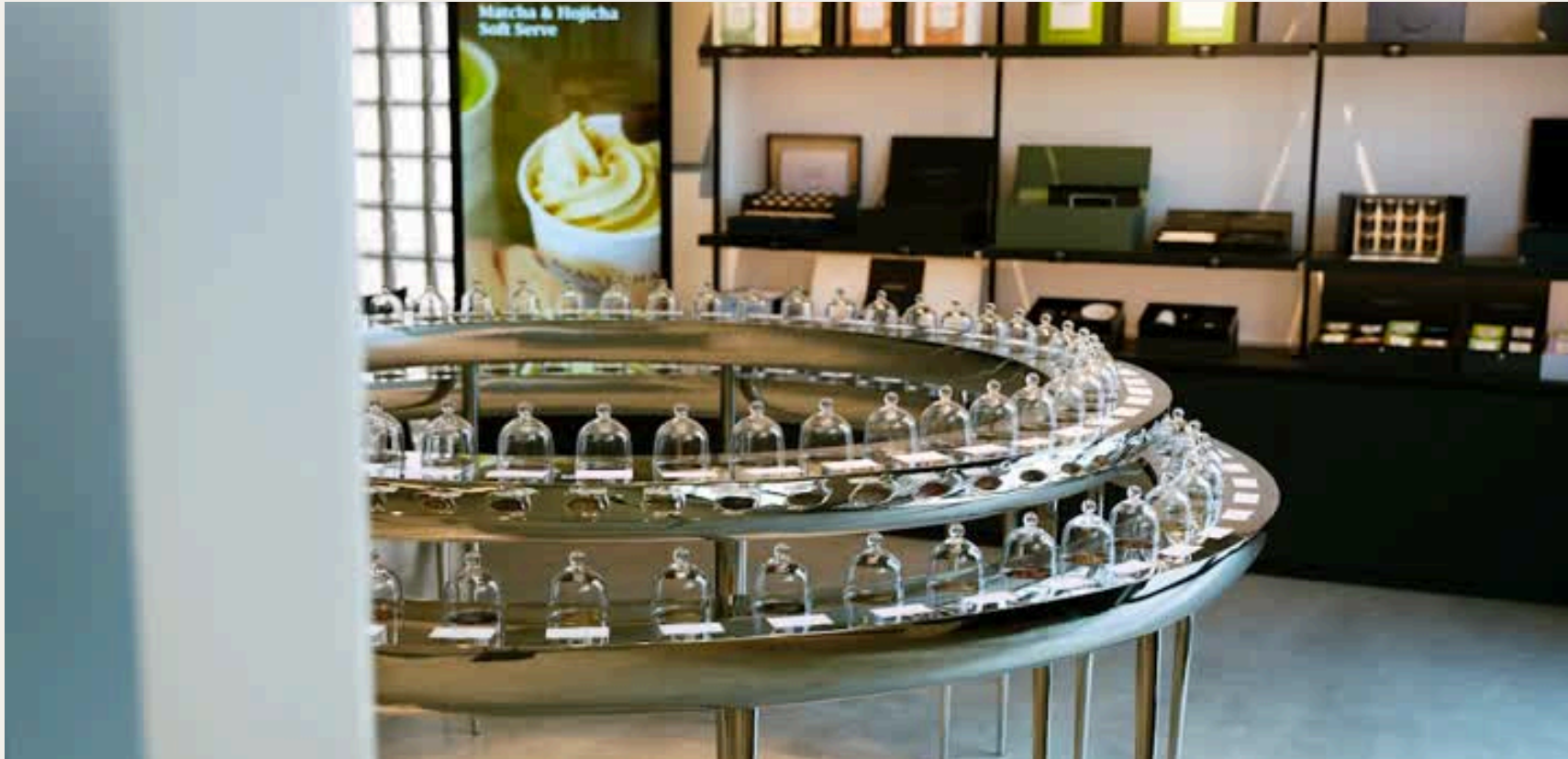
Scalify X Avantcha