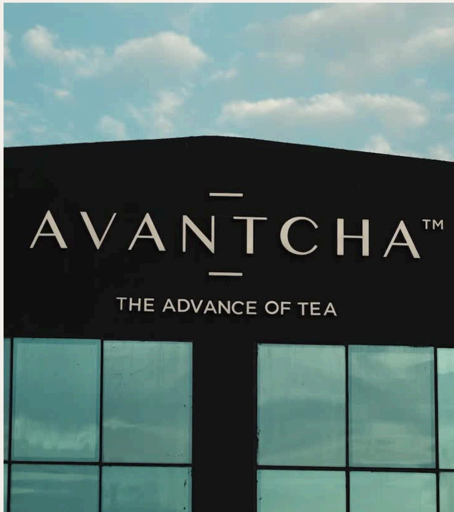
Scalify X Avantcha