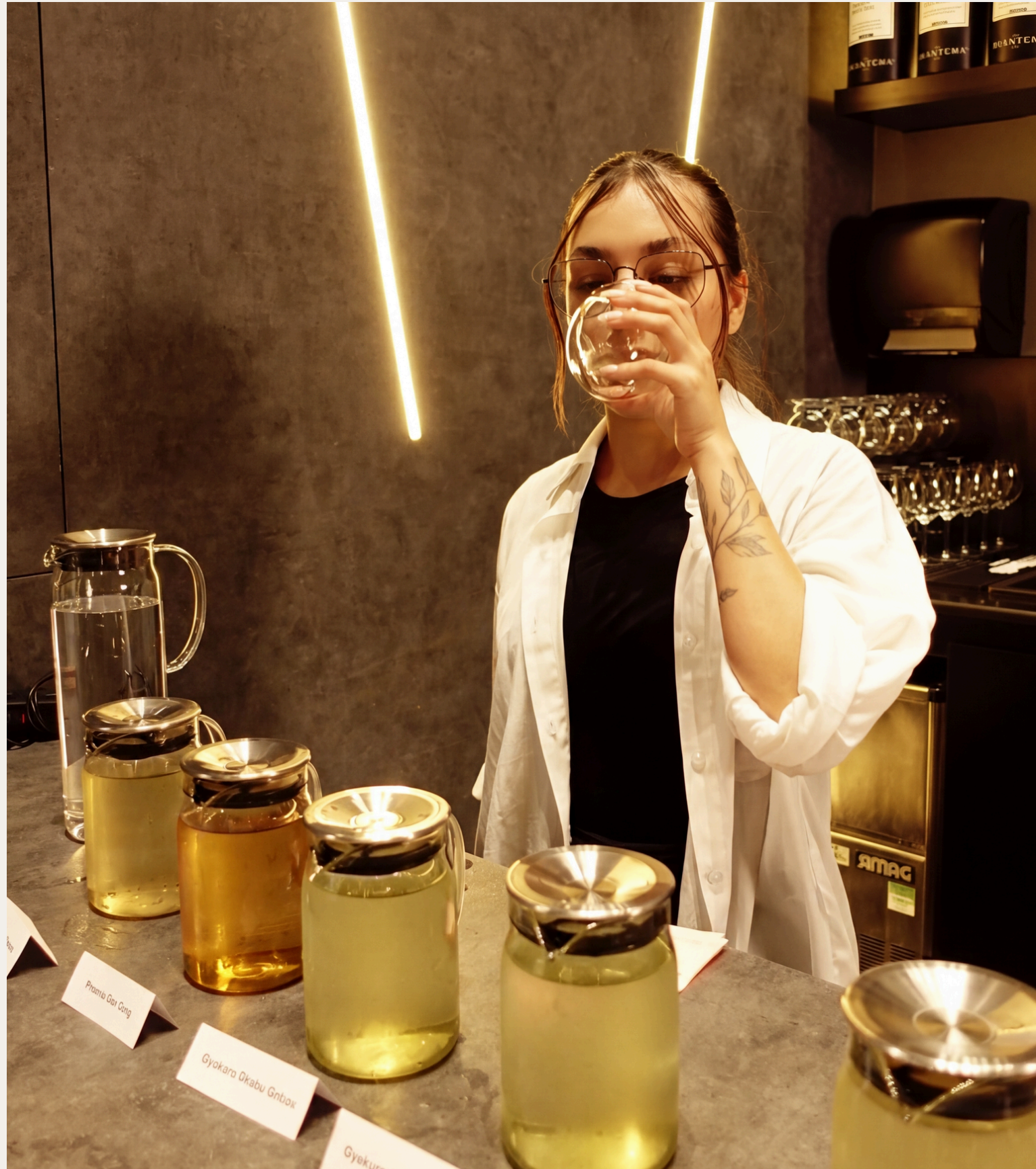
Scalify X Avantcha